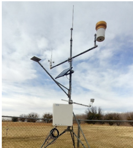
New Mexico Climate Center (WS-2) NMSU Farmington

National Oceanic and Atmospheric Administration (NOAA) National Weather Service (NWS) - Albuquerque, NM and New Mexico Climate Center for maintenance and equipment housed at the NMSU's Agricultural Science Center at Farmington.